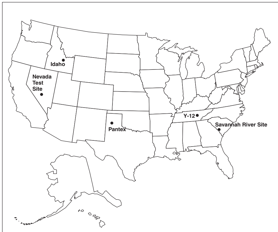
Figure 2: Proposed Consolidation Sites for Category I Special Nuclear Material

In 2005, DOE chartered the Nuclear Materials Disposition and Consolidation Coordination Committee (the committee) to study and plan for the consolidation of DOE’s inventory of special nuclear material at fewer sites (see fig. 2.), and the permanent disposition of material it no longer needs.